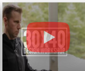
Why modelling is used in design.