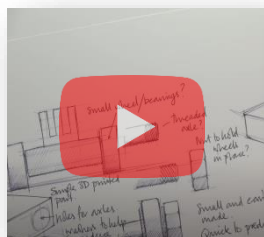
The importance of using annotations when design sketching.

Click on the image tiles below to access useful links/videos.